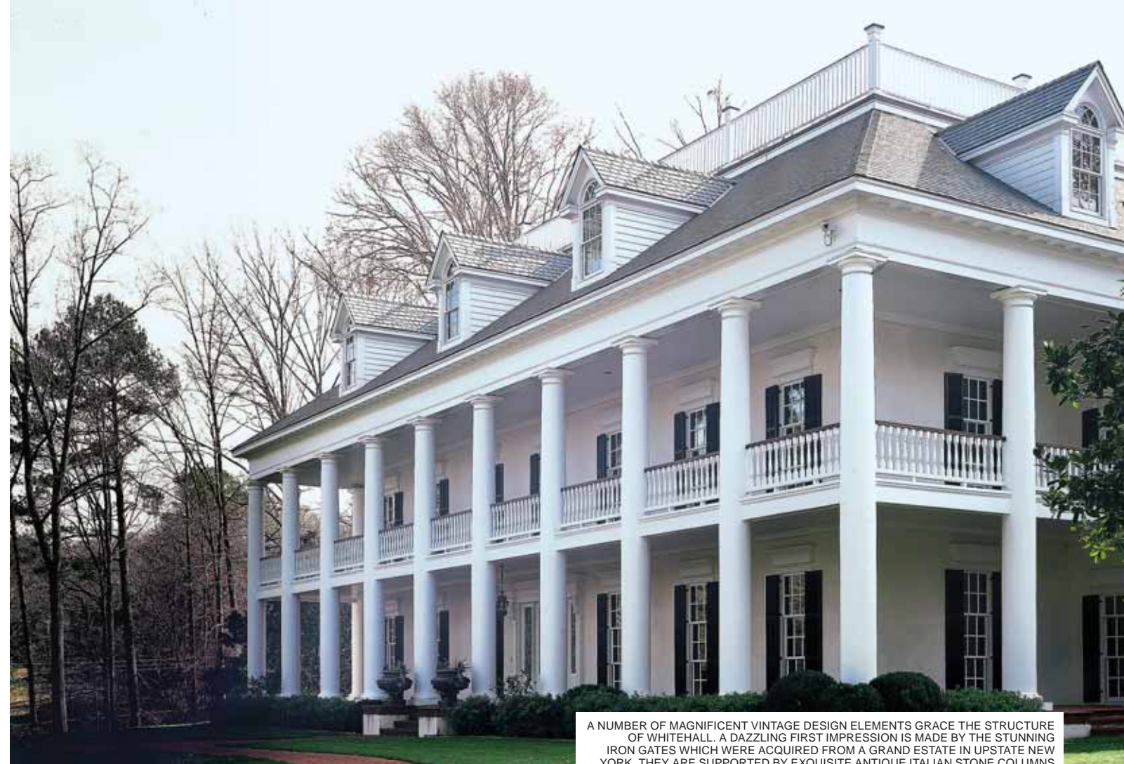
A NUMBER OF MAGNIFICENT VINTAGE DESIGN ELEMENTS GRACE THE STRUCTURE OF WHITEHALL. A DAZZLING FIRST IMPRESSION IS MADE BY THE STUNNING IRON GATES WHICH WERE ACQUIRED FROM A GRAND ESTATE IN UPSTATE NEW YORK. THEY ARE SUPPORTED BY EXQUISITE ANTIQUE ITALIAN STONE COLUMNS FROM RED BARON'S ANTIQUES, SETTING THE TONE AT THE ENTRANCE TO THE ESTATE. THE MASTERFUL DESIGN OF THESE GATES WAS REPLICATED IN THE WROUGHT-IRON FENCING WHICH ENVELOPES THE PERIMETER OF THE PROPERTY. THROUGHOUT THE HOME, THERE ARE UNIQUE BRASS AND CRYSTAL CHANDELIERS THAT WERE REDESIGNED FROM ANTIQUE GAS LIGHTS.