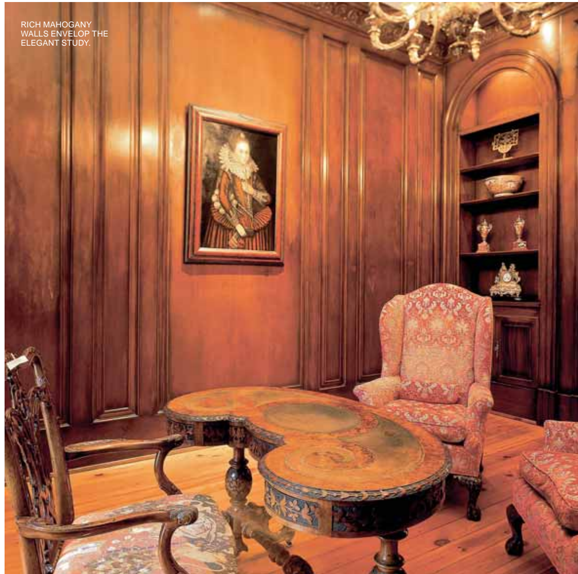
RICH MAHOGANY WALLS ENVELOP THE ELEGANT STUDY.

architectural elements that are centuries old including the heart pine floors which were cut from a 200-year-old New Orleans riverfront warehouse. The mahogany kitchen cabinets and two-inch-thick solid mahogany doors throughout the home were crafted from antique mahogany by artisans in Bath, England.