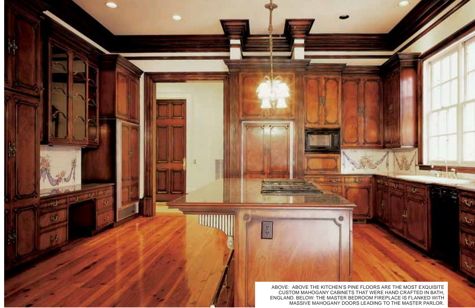
ABOVE: ABOVE THE KITCHEN'S PINE FLOORS ARE THE MOST EXQUISITE CUSTOM MAHOGANY CABINETS THAT WERE HAND CRAFTED IN BATH, ENGLAND. BELOW: THE MASTER BEDROOM FIREPLACE IS FLANKED WITH MASSIVE MAHOGANY DOORS LEADING TO THE MASTER PARLOR.