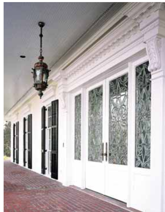
THE GRAND HAND-CUT LEADED GLASS FRONT DOORS ARE QUINTESSENTIAL SOUTHERN DESIGN ELEGANCE.

The home's twelve-foot-high ornate ceilings and nine-foot-tall mahogany paneled doors with ornate polished brass hardware reflect a love of nineteenth century plantation homes. Indeed, while the house itself is relatively young, it's constructed of many