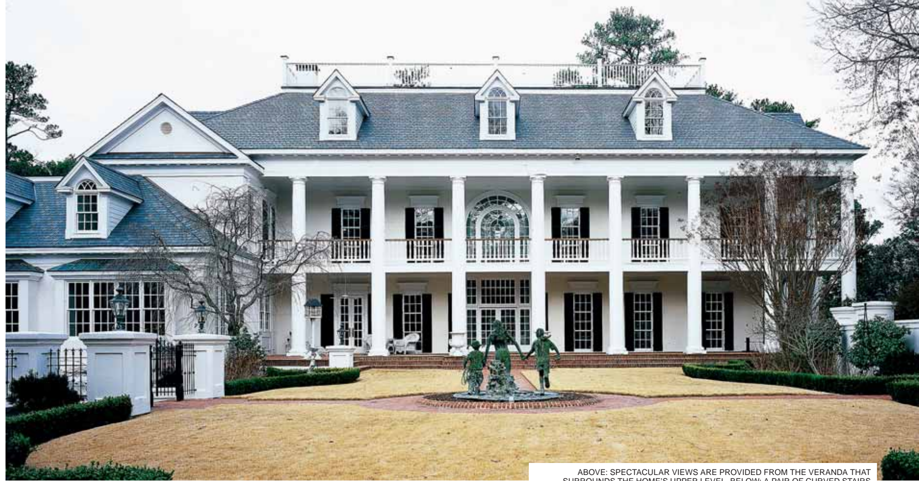
ABOVE: SPECTACULAR VIEWS ARE PROVIDED FROM THE VERANDA THAT SURROUNDS THE HOME'S UPPER LEVEL. BELOW: A PAIR OF CURVED STAIRS LEADS FROM THE POOL AREA UP TO THE FORMAL GARDEN. BOTH AREAS OF THE BACK LAWN ARE BEAUTIFULLY APPOINTED WITH SCULPTURES AND FOUNTAINS.

From the main level, a rear stairwell leads upward to the third floor which contains a media room, golf