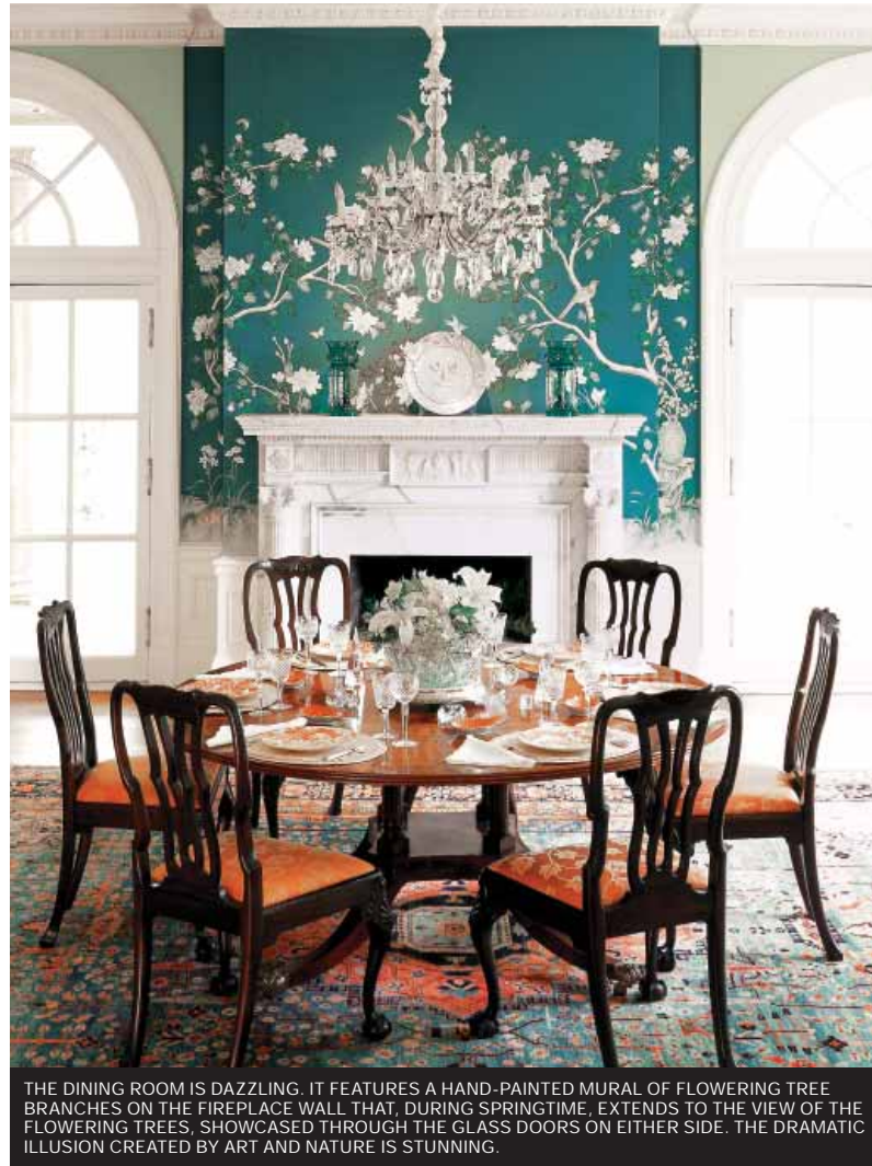
THE DINING ROOM IS DAZZLING. IT FEATURES A HAND-PAINTED MURAL OF FLOWERING TREE BRANCHES ON THE FIREPLACE WALL THAT, DURING SPRINGTIME, EXTENDS TO THE VIEW OF THE FLOWERING TREES, SHOWCASED THROUGH THE GLASS DOORS ON EITHER SIDE. THE DRAMATIC ILLUSION CREATED BY ART AND NATURE IS STUNNING.

and gardens. In recent years, the Garlands added recessed pin lights into the solarium's ceiling. They were thrilled the first evening to discover that the enhanced lighting created an illuminated reflection of the marble statue that centers the room in every one of the windows, making the room nothing less than breathtaking, both at night as well as day.