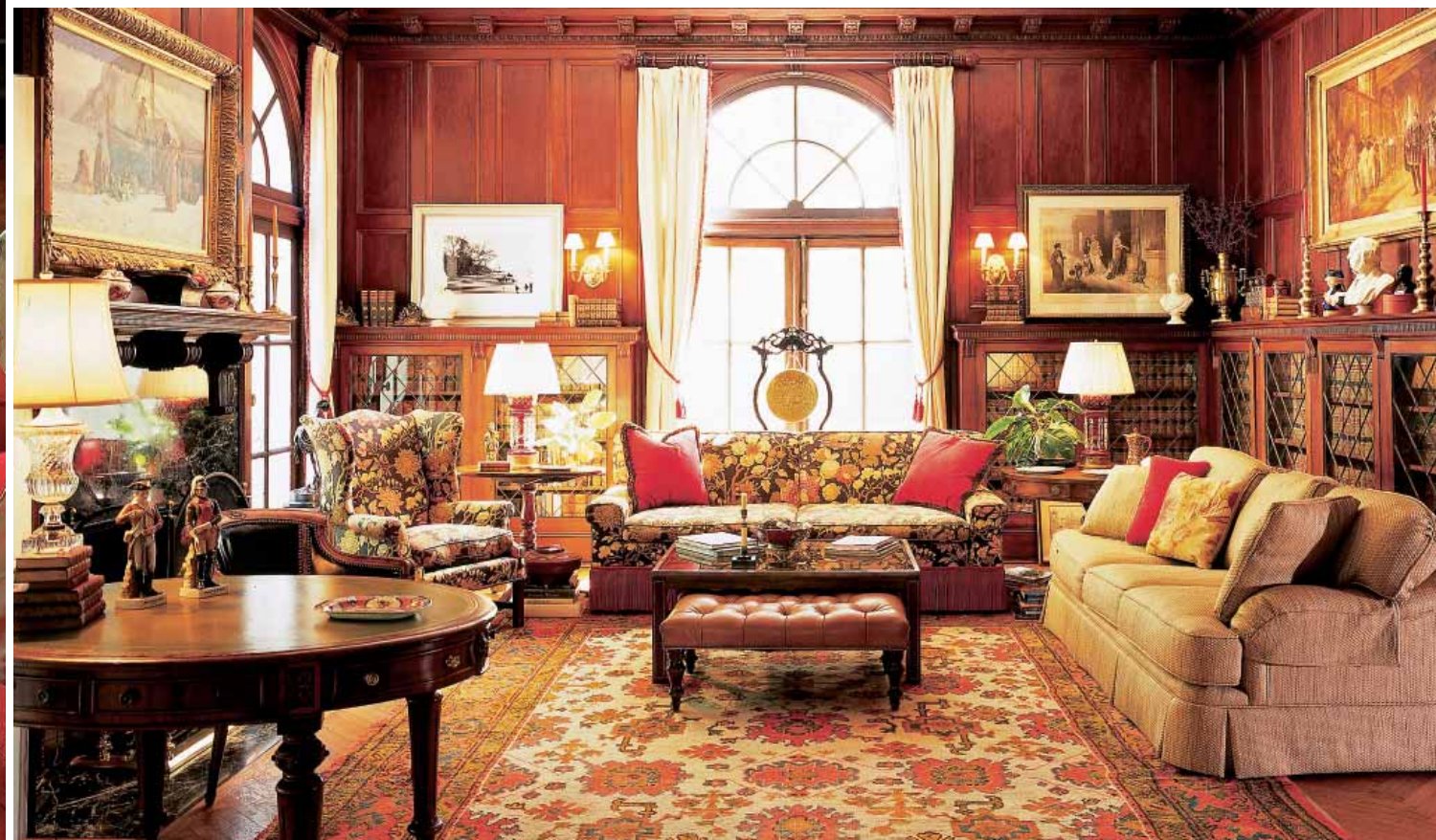
ABOVE: THE HOME'S SOLARIUM IS GRAND AND GORGEOUS WITH VIEWS OF THE LUSH TREES AND GARDENS. AT NIGHT THE RECESSED PIN LIGHTS CREATE A STUNNING ILLUMINATED REFLECTION OF THE MARBLE STATUE THAT CENTERS THE ROOM IN ALL SURROUNDING WINDOWS. LEFT: THE RICH WALNUT WALLS AND CABINETS OF THE LIBRARY DISPLAY A WEALTH OF PERSONAL TREASURES OF THE GARLAND FAMILY.