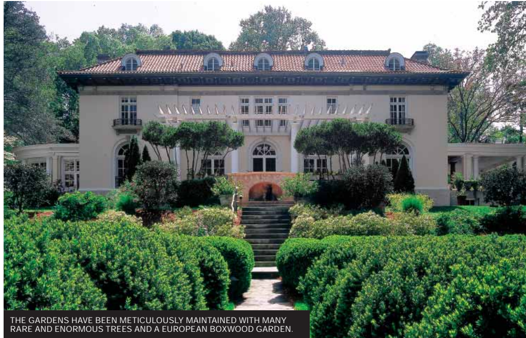
THE GARDENS HAVE BEEN METICULOUSLY MAINTAINED WITH MANY RARE AND ENORMOUS TREES AND A EUROPEAN BOXWOOD GARDEN.

The walls are hand finished in intense shades of yellows and golds over the creamy marble floors. The soaring ceilings and windows seem to nestle the space in the lushness of the surrounding trees