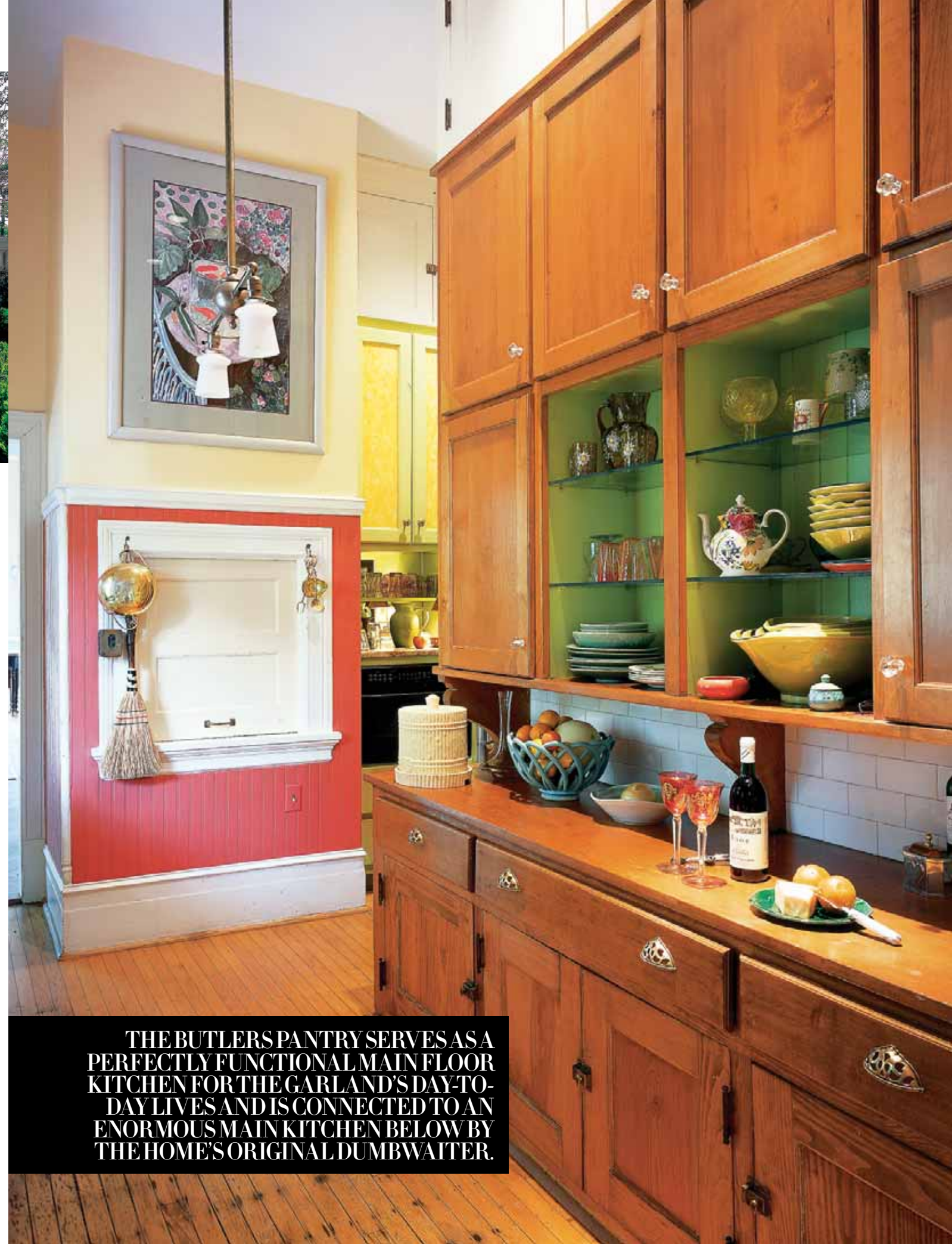
THE BUTLER'S PANTRY SERVES AS A PERFECTLY FUNCTIONAL MAIN FLOOR KITCHEN FOR THE GARLAND'S DAY-TO-DAY LIVES AND IS CONNECTED TO AN ENORMOUS MAIN KITCHEN BELOW BY THE HOME'S ORIGINAL DUMBWAITER.

and a conversation piece of the craftsmanship that could rarely be found in today's world. The portico is still in use but a BMW has replaced the horse and buggy!