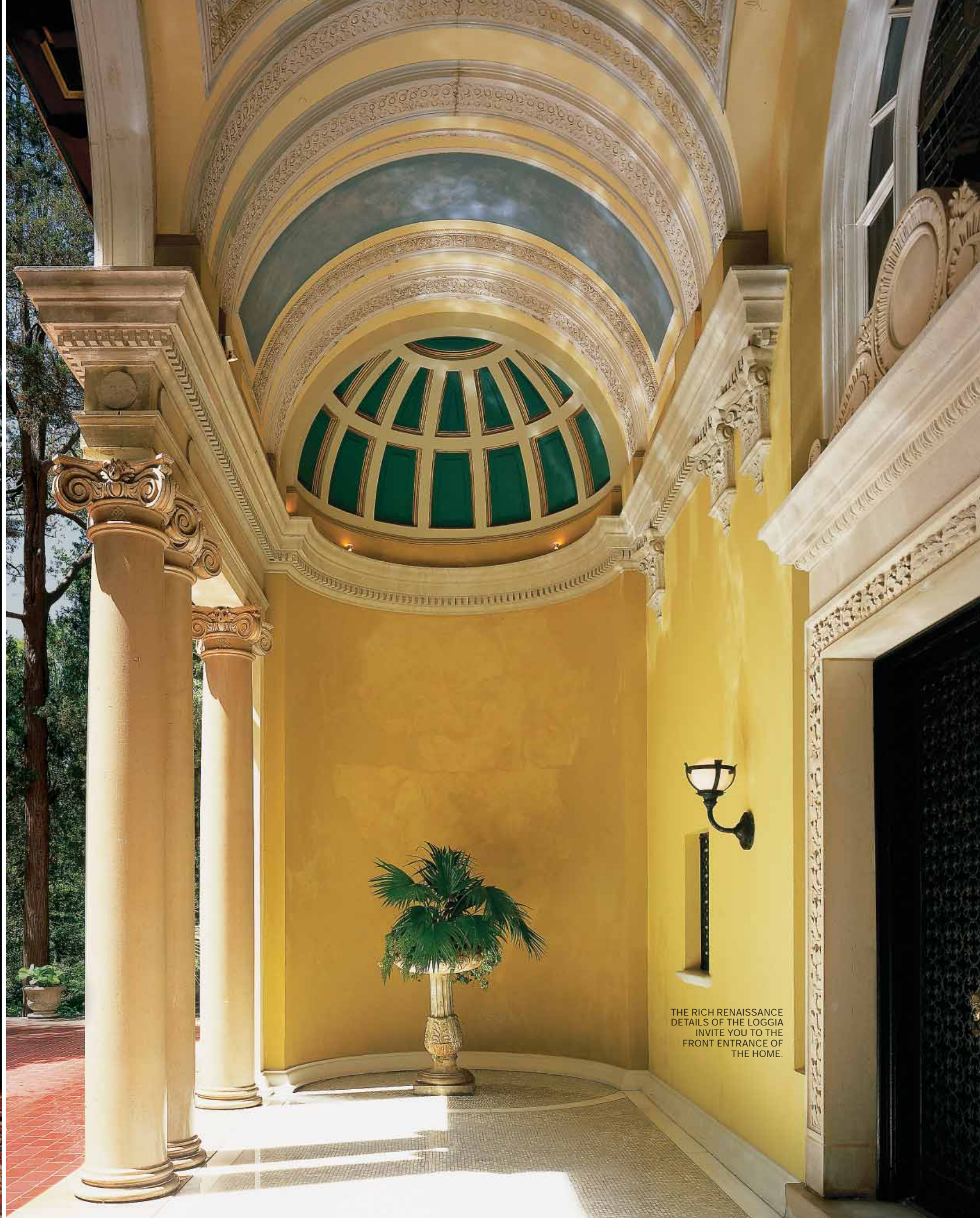
THE RICH RENAISSANCE DETAILS OF THE LOGGIA INVITE YOU TO THE FRONT ENTRANCE OF THE HOME.